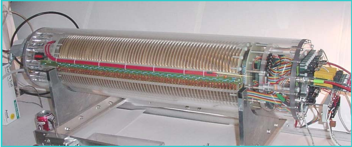
Figure 2: Time Projection Chamber at Cornell University. The drift cage has an inner diameter of 14.6 cm and length of 64 cm.